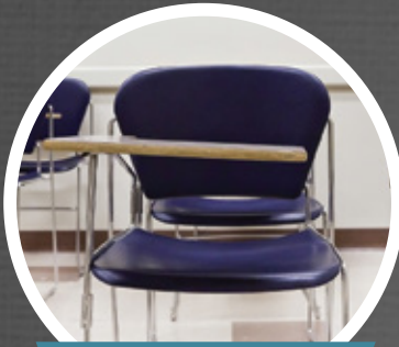
DESKS AND CHAIRS

CLEAN & DISINFECT ALL HARD SURFACES, SUCH AS: