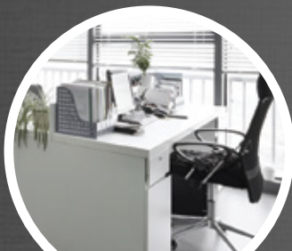
DESKS AND CHAIRS